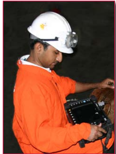
MHG Services successfully demonstrated the ability of its technicians to locate and size welding defects by utilizing Phased Array UT Testing.

During the outage, Phased Array technology was used for Code acceptance of approximately 150 boiler header welds fabricated from SA-335, P22 (2 ¼ Chrome) material. The header sizes consisted of both 7.5" O.D x 1.375" MW and 10" O.D. x 2.5" MW welds. All welds were inspected both before and after post weld heat treatment. The use of advanced ultrasonic technology eliminated the need for performing