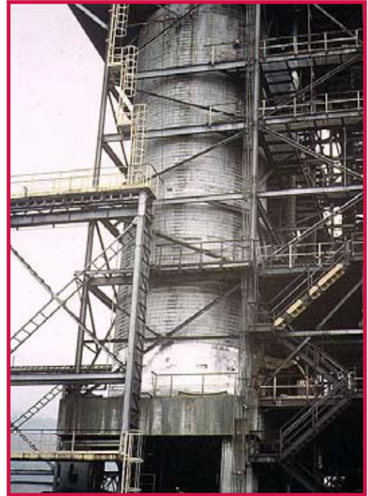
Typical Coke drum inspections are difficult and costly. MISTRAS recommends Phased Array for a more rapid inspection method that delivers dependable, recordable visual data.

Array inspection was suggested. It has the advantages of electronic steering and focusing of the beam. This, in turn, provides for a larger area of inspection with much less rastering of the probe and greater accuracy of defect sizing. The inspection data is recordable in a secured file format.