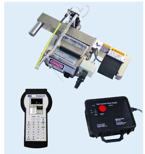
Pocket UT™ system not included; may be purchased separately.

For more information on the MINI Scanner or the Pocket UT™, please call 1-609-716-4000 or visit us on the web at www.mistrasgroup.com