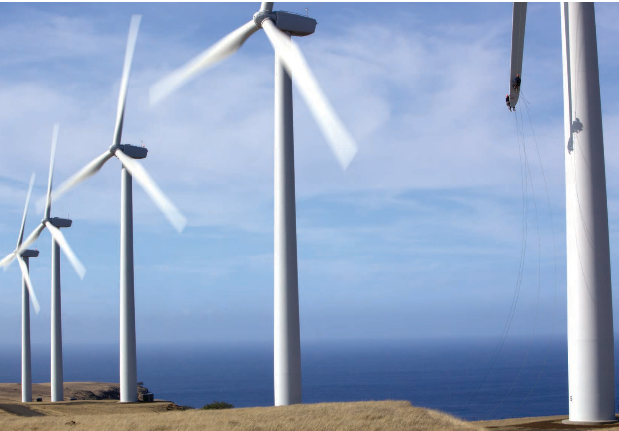
MISTRAS Ropeworks blade technicians performing repairs during brief favorable weather windows on the southern tip of the big island, Hawaii.