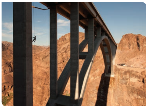
BRIDGE & HYDRO