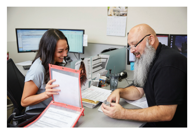
faster than others in the industry. All jobs that come in are taken through contract review and first article inspection.

In their Special Processes department, their multidisciplinary ASNT Level III NDT staff and other specialists have many years of experience in product evaluation, testing and inspection. Their NDT Services include: