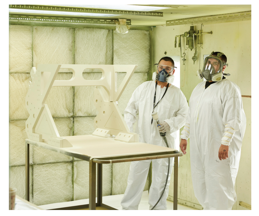
determined that MISTRAS was the best fit.

Semiray manages their growth through continuous process improvements. They recently added a new conversion chemical film line, and they are planning their building expansion with a larger anodize line and paint capabilities. As a result of their continuous improvement initiatives, Semiray continues to see double-digit growth year over year.