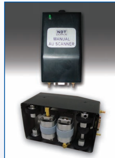
The AU Rolling Scanner Unit operates with the Pocket AU™ hand-held unit.

The "Preferences" menu allows the setting of defaults and control system-wide parameters, such as selecting the "Directory" for data files, waveform "Capture Mode," "Units," "File Export Format" and "AutoSave Settings on Exit." A test is initiated via the "Run" menu. This test can be a C-Scan test or an A-Scan monitoring of the structure. The "Help" menu provides information about the Pocket AU™ system.