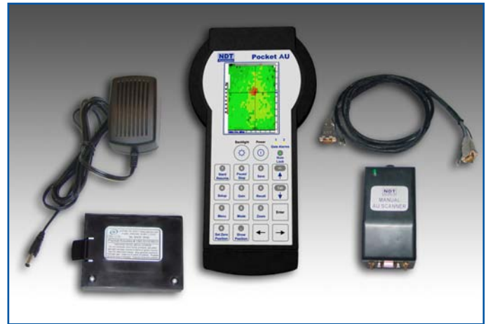
The Pocket AU™ System comes with hand-held, single-channel AU unit, Rolling Scanner, 2 meter cable and a battery-eliminator DC power supply (case not shown).

The "Setup" menu allows the selection of the "Pulser" setup menu for setting up the burst generator, the "A-Scan" mode for setting up the waveform parameters, including the viewable part of the A-Scan interactively (using waveform start and length settings), filtering and gate settings for capturing the Peak Amplitude and Time-of-Flight within the gate. In the "Comments" menu, a text string relating to the test can be entered.