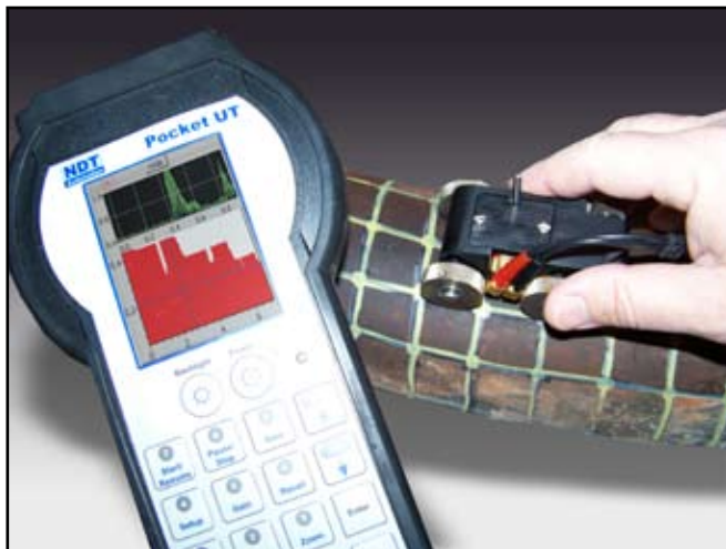
Mini B-Scan is designed for use with our Pocket UT™

The encoder is sealed and water tight to protect against moisture ingress and gear driven to prevent slippage.